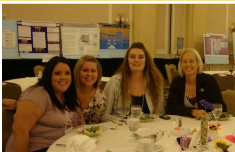
CPH students join each other at reserved tables for lunch at the KPHA conference.